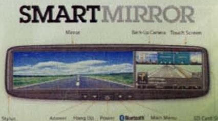
*Prize model not shown. Actual package subject to availability.

Escort Drive Smarter Prize Package PLUS Sweepstakes Opportunity*