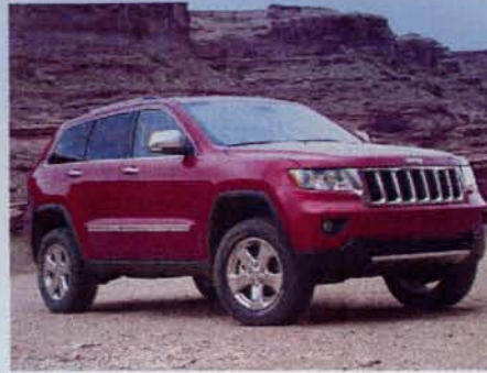
*Prize model not shown. Actual vehicle subject to availability.

Hole # 8 Atlantic City Trump / McCullogh's Emerald Golf Vacation